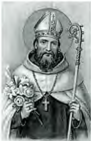
St. Andrew Corsini

T his saint was baptized Andrew in Florence, in 1302. At that time, the Corsini family was one of the most illustrious of that territory. Andrew was the fruit of the