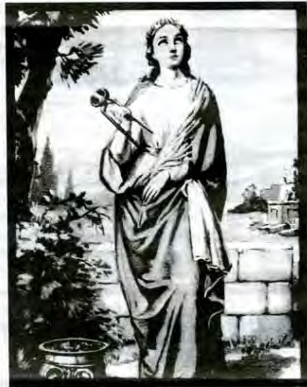
St. Agatha — Virgin and Martyr

In this infamous place, the sweet saint suffered assaults