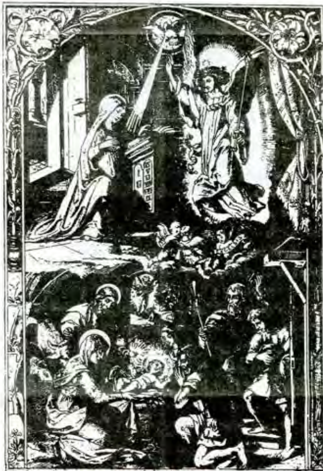
The Virgin Mary and St. Gabriel, the Archangel