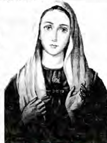
Our Lady's Immaculate Heart

Down deep within my pocket Everywhere I go I keep a small reminder Of seeds I'm called to sow. It calls to mind the message He taught by word and deed; The love His life has shown to us The truth by which we're freed. It starts with heavenly tidings, A Savior has been born In a cave in Bethlehem On this very morn. Its cross keeps ere before us The love of Calvary; Its beads a help in counting The pains He bore for me. May I never be discouraged Whatever life may bring; For trials give way to glory In that eternal spring. Whenever go my thoughts astray As fingers tell the beads And tiredness makes it hard to pray My longing heart He reads. O Mother dear I'm gratified For all You've done for me; This gift from You I cherish so My blessed Rosary.