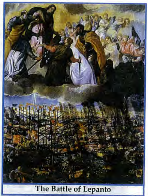
The Battle of Lepanto

The illustrious Pontiff, whose life's work was now completed, did not survive to celebrate the anniver-