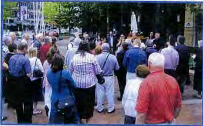
"Our Lady of Fatima vs. the New World Order"

The conference was free, and people came both from the local area and from surrounding states to be present. Some came from as far as Wisconsin, Maine, Florida and Texas. Close to 400 people attended. A strong spirit of prayer and like-minded camaraderie permeated the weekend.