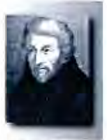
St. Peter Canisius said that Mary could have lived in comfort ... but She preferred to remain poor.

Let us then, as St. Augustine exhorts us, "love that one good in which all good things are found." Let us address Our Lord in the words of St. Ignatius: "Give me only Your love and Your grace, and I shall be rich enough." "When we have to suffer from poverty," says St. Bonaventure, "let us console ourselves with the thought that Jesus and His Mother were also poor like ourselves." Most holy Mother, You had good reason to say that Your whole joy was in God: And My Spirit hath rejoiced in God My Savior . In this world You desired and loved nothing but God. Draw Me ... after Thee (Cant. 1:3). O Lady, detach me from the world, that I may love Him alone, Who alone deserves to be loved. †