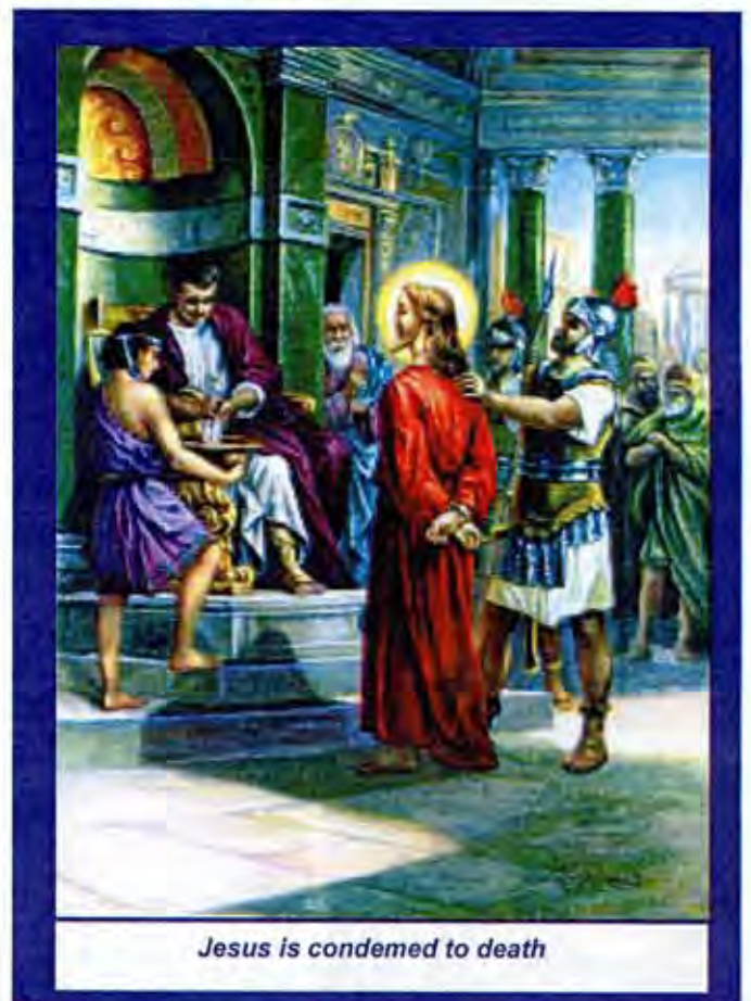
Jesus is condemned to death

As it was in the beginning, is now, and ever shall be, world without end. Amen