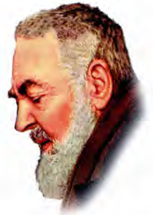
St. Padre Pio understood the value of a good book and criticized time wasted with frivolous reading.

Our children need something positive to believe in. There is nothing more positive than the love of Our Lord and Our Lady. They need you to help them find that love. †