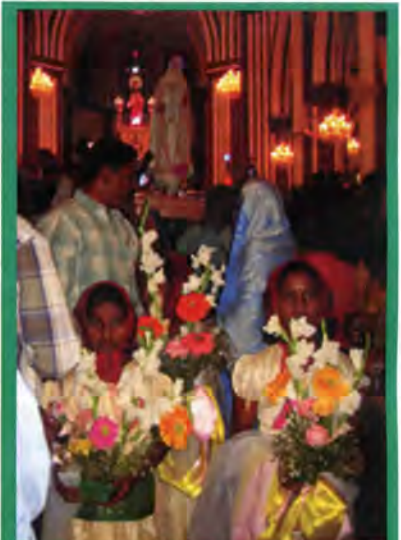
Many children took part in processions.

Between conferences, attendees flocked to the tables which displayed Fatima Center literature and sacramentals. This is one of