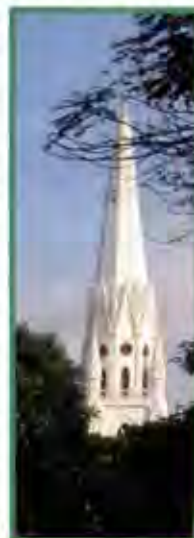
To find out where this impressive spire is located, turn to page 3.