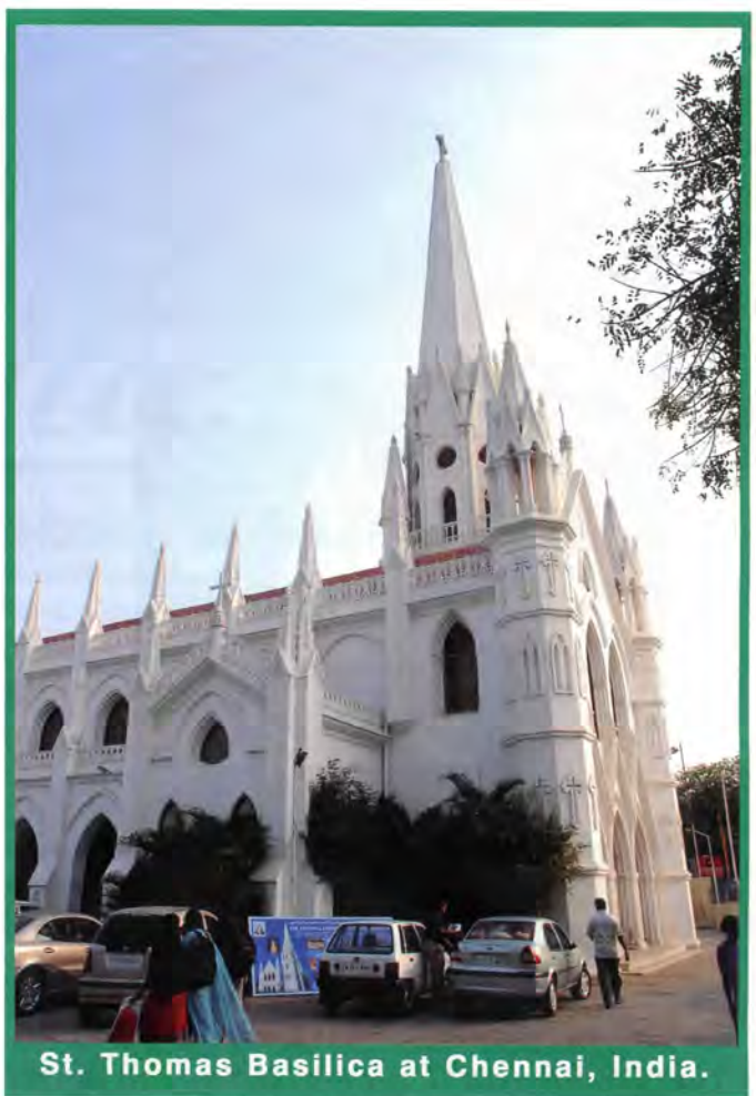
St. Thomas Basilica at Chennai, India.

This was the third international conference in the past year and a half, and there were many indications to say it was the most successful to date. Over six hundred priests and bishops registered for the week-long conference.