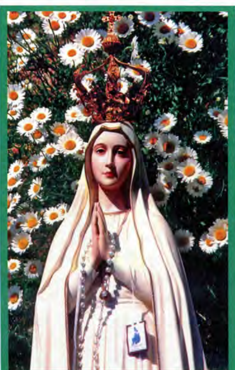
A picture of Our Lady is a highly prized item.

NEWS FROM INDIA, AND MORE Continued from page 3