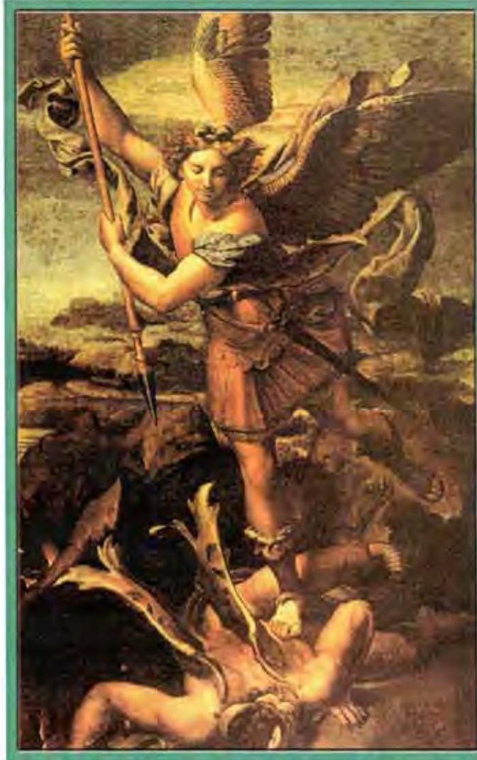
St. Michael, defender of all that is good.

It is embarrassing for some to mention religion at all, and quite natural to make light of some principle or prac-