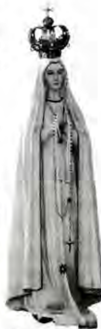
Only I can help you.

Kneel, ye mighty mountains, Bend low, O forests green, Let all creation spread its cape In honor of the Queen.