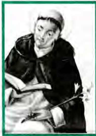
St. Dominic, the great preacher

'Of course I was overjoyed, took the book and read every word of it. Just as Our Lady had said, I found exactly the right things to say in my sermon, so I thanked Her with all my heart.