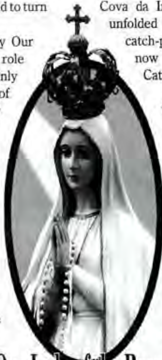
Our Lady of the Rosary

understood in Catholic terms, so too, can it be obeyed only through Catholic means. The great Miracle of the Sun was the seal of God on the promises made by His Mother in the Cova da Iria to three peasant children. The Miracle unfolded in specific stages, the descriptive catch-phrases of which provide sound bites that are now permanently chiseled into the vocabulary of Catholics: