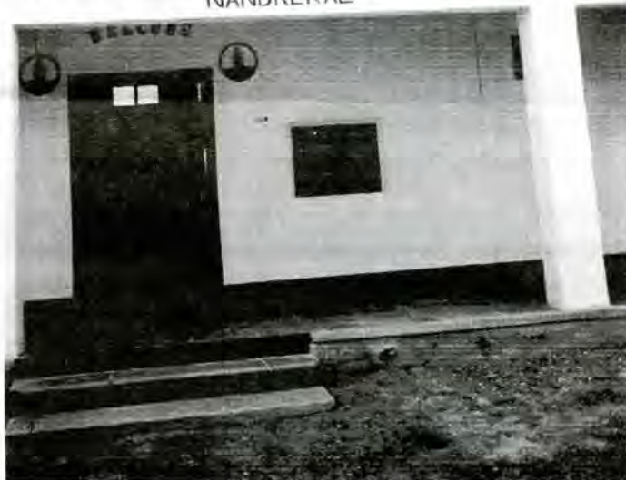
Our new St. Joseph's Infirmary in India